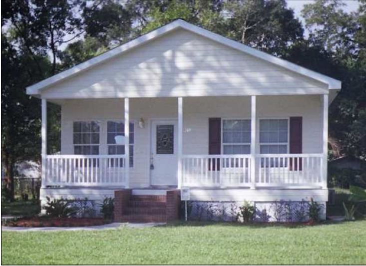
OPTIONAL PORCH SHOWN. STAIRS, RAILS, ETC. ON SITE BY OTHERS

SOME ITEMS SHOWN ARE FOR DECORATIVE PURPOSES ONLY AND MAY NOT BE A STANDARD ITEM WITH THE HOME.